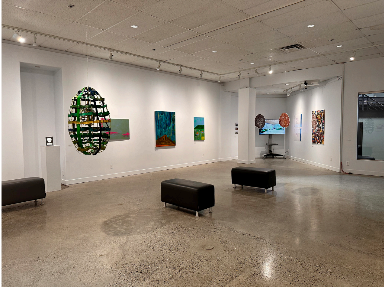
Exhibit Installation (2024)