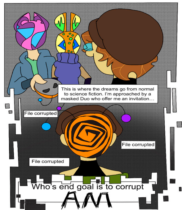
Figure 1. Excerpt from Final Zine, "AM" (2024) by Bryanna Dyer, Digital Comic.

Adapting Ellison's harrowing short story was an intimidating yet necessary undertaking. As an anti-capitalist comic artist living through the rapid rise of generative AI, I felt compelled to view AM—Ellison's AI antagonist—through the lens of our late-stage capitalist society. Unlike typical AI villains,