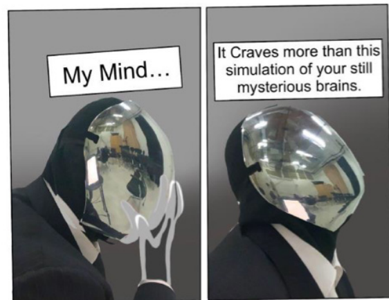
Figure 2. Excerpt from Final Zine, "AM" (2024) by Bryanna Dyer, Digital Comic.

"I feel strongly that the original work is more relevant than ever. AM is omnipresent—my hope is that readers see what an AM with internet access can become, and the dehumanizing potential of controlling people's perceptions of themselves and their reality."