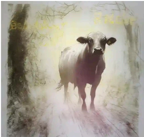
Figure 4. Midjourney AI images generated from a blend of the Artist's original artwork (prompt and original artwork images shown in Figure 5)

biases or blind spots. The reproducibility inherent in printmaking mirrors the iterative process of AI, highlighting the themes of repetition and variation that underpin my work.