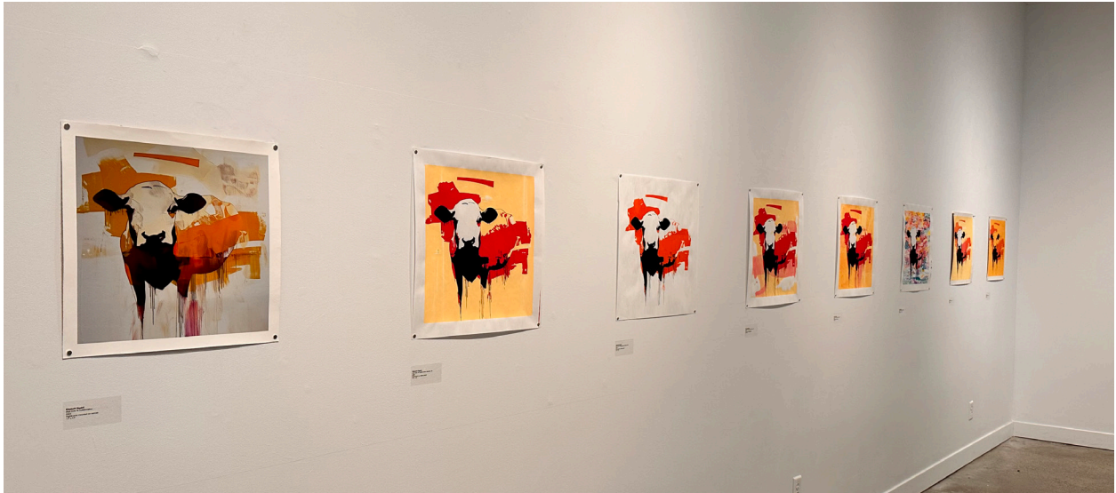
Figure 5. Exhibit Installation of multiple Pink Cow AI Collaboration Iterations.