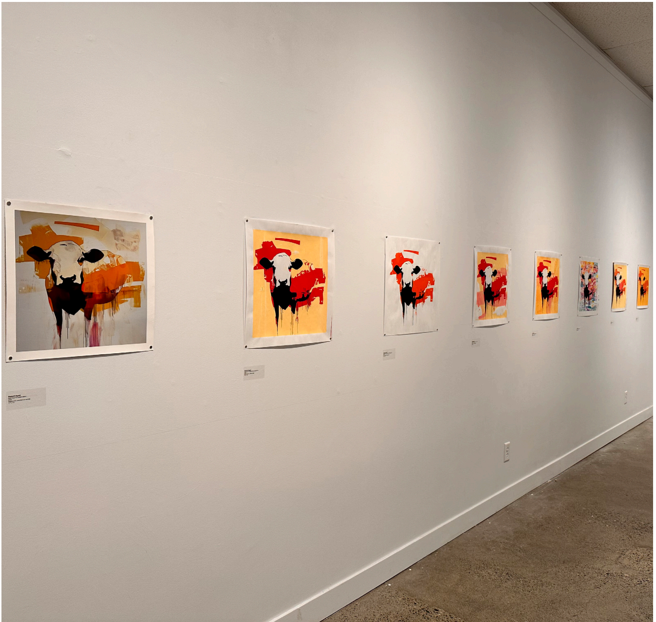
Exhibit Installation of multiple Pink Cow AI Collaboration Iterations. by Elizabeth Sigalet