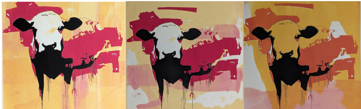
Figure 1. Pink Cow AI Collaboration Iterations, by Elizabeth Sigalet (2024). Screenprint on Masa paper, 18" x 18" [each]. (Image credit: Elizabeth Sigalet).

unique practices, these students explored Gen AI as a tool, a collaborator, and/or a conceptual influence.