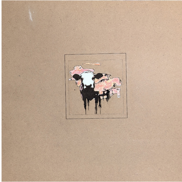
Figure 2. Pink Cow AI Collaboration Iteration by Elizabeth Sigalet. Laser cut MDF and acrylic paint.

medium is screenprint, with variations of incorporating digital and hand-drawn elements. Midjourney was used to generate unique images by blending my own paintings and intaglio prints. These were used as reference for manipulation in Adobe Photoshop