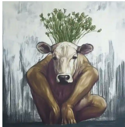
Figure 3. two of the artists original artworks which she asked Midjourney to blend. (Image credit: Elizabeth Sigalet).