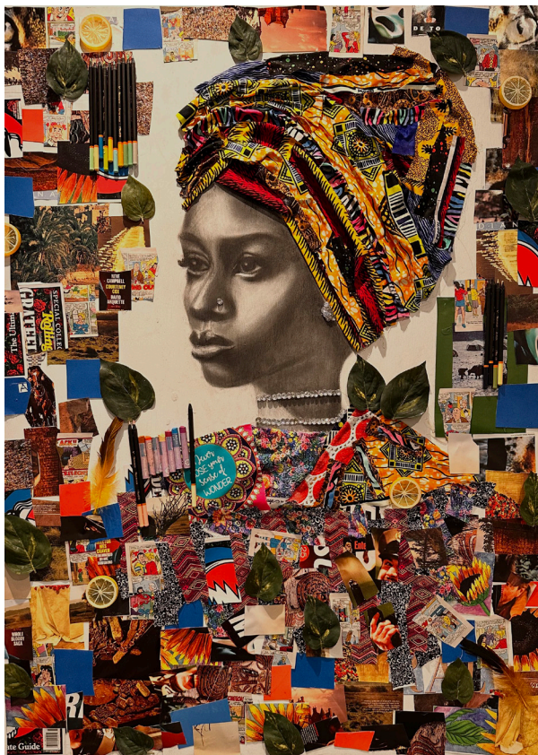
Figure 1. Lanaya Meets AI (2024) by Raluchukwu Ojah. Mixed Media, 36" x 48"

This special issue of Future Earth Journal: Explorations in Art and Generative AI showcases the work of visual art students from the Fall 2024 Selected Topics visual art course Explorations in Art and AI . Each featured artist engaged with generative artificial intelligence (Gen AI) to create original artworks that respond to and reflect on current conversations in art and technology. Through their unique practices, these students explored Gen AI as a tool, a collaborator, and/or a conceptual influence.