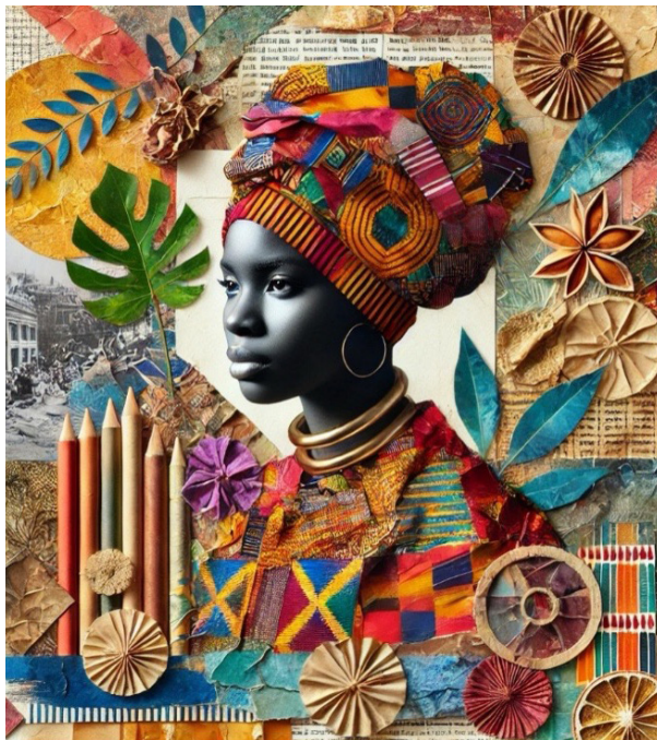
Figure 3. DALL-E generated image used as a reference for Ral's original artwork.

Copilot gave me some useful ideas to begin work with such as using a different surface to work on, using cultural and historical references and implementing cutout pictures. However, I still desired a visual representation of these examples. I tried to upload my artwork unto Copilots platform but to no avail. So I switched to ChatGPT.