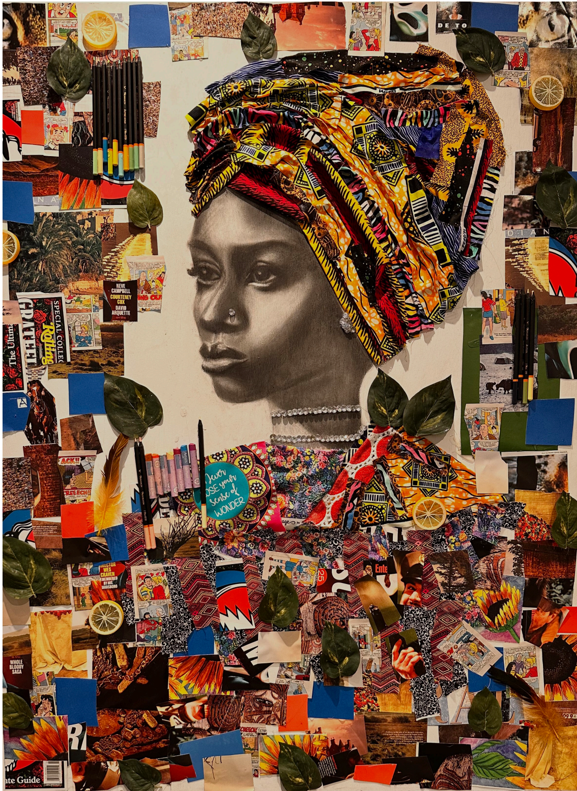
Lanaya Meets AI (2024) by Raluchukwu Ojah. Mixed media, 36" x 48"