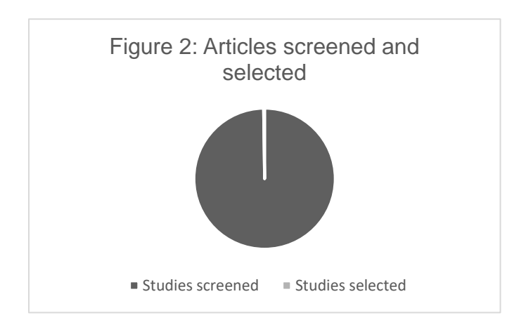
Figure 2 . Articles screened and selected. This figure demonstrates the limited number of articles utilized in this scoping review as per the screening criteria.